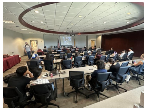
Legislative Internship Series, September 24th Afternoon Session. 39 NMSU students in attendance.