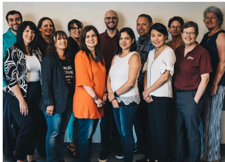
Image Source: NMSU Newsroom, NMSU College of Education to receive nearly $3.5 million in federal funding for scholarships